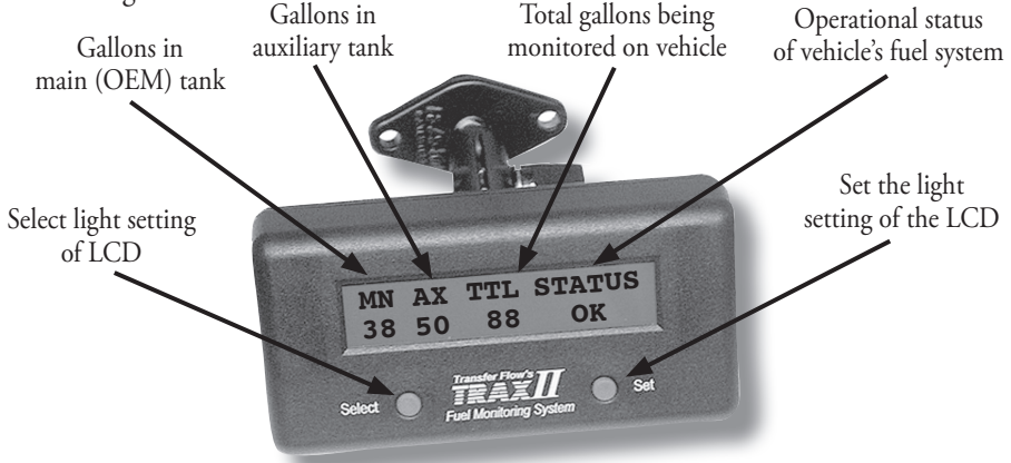
Trax-II Computer Module (Front)